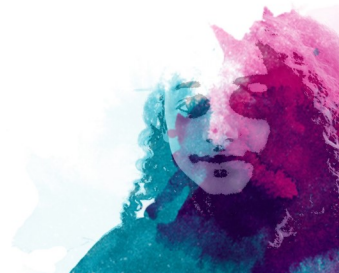
Olivia H - Honorable Mention - Digital Art