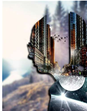
Chloe H - Silver Key - Digital Art